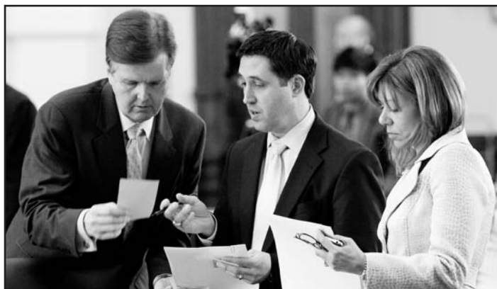
Counting votes on my tally sheet with Senators Glenn Hegar and Joan Huffman.

Fighting Drunk Driving: Texas currently ranks No. 1 in the nation for drunk driving fatalities. I proposed two bills to curb the devastating effects of drunk driving. One would have increased penalties for drunk drivers with a blood alcohol level that was double the legal limit. The other bill extended the license suspension period for drivers that refuse to submit to a breathalyzer test. Unfortunately, I was unable to garner enough support to pass them but I will continue to fight against this problem in future sessions.